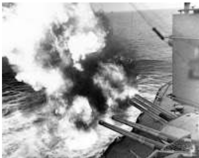
Nevada supporting the landings on Utah Beach, 6 June 1944

The U.S. Navy Flight Demonstration Squadron, the Blue Angels, fly over Chicago during the 2019 Chicago Air and Water show. The Blue Angels are scheduled to conduct 61 flight demonstrations at 32 locations across the USA to showcase the pride and professionalism of the U.S. Navy and Marine Corps to the American public in 2019.