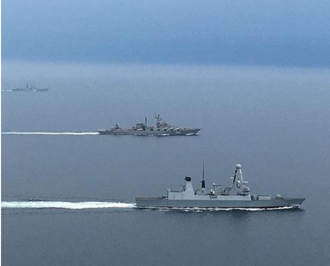
HMS Diamond escorting Russian ships Severomorsk and Marshal Ustinov through the English Channel

Type 45 destroyer HMS Diamond shadowed two Russian warships as they passed through the English Channel