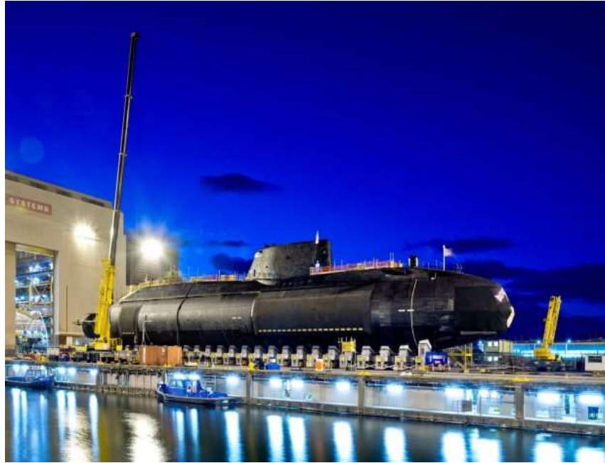
HMS Audacious prepares for launch in Barrow. The fourth Astute class submarine entered the water for the first time last Friday.