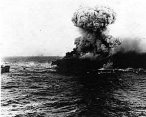
USS LEXINGTON – BATTLE OF THE CORAL SEA 8 th MAY 1942.

The Japanese were seemingly unstoppable in their expansion across the Pacific. Until that is, the Battle of the Coral Sea.