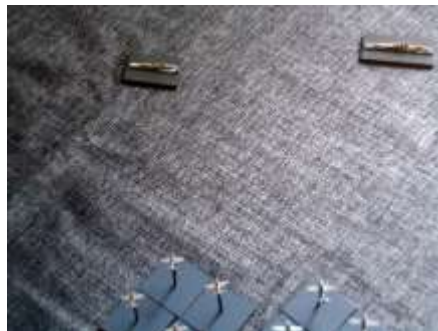
The US strike approaches the Japanese screen, HIJMS Amatsukaze and Tone .

Battle of the Eastern Solomons: Attack on Ryujo , 24 August 1942. The Game was played by the Florida based Historical Miniatures Gaming Society and ended with the Ryujo ablaze which caused a magazine explosion.