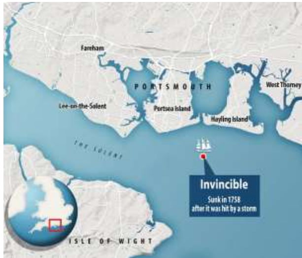
Map from the Daily Mail.

The ship was launched by the French in 1744 as L'Invincible. With two decks and a crew of 700, she was one of the most impressive vessels of its time. (Several vessels based on her design were present at the Battle of Trafalgar in 1805). One of 12 French warships captured by the British at the Battle of Cape Finisterre, she was renamed Invincible and sent to places as far away as the West Indies and Nova Scotia. Her 14-year service came to an abrupt end on February 19, 1758, when she ran aground on the Horse Tail Sands three miles off Portsmouth.