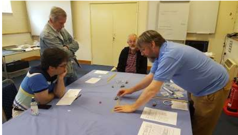
Is that George Clooney standing at the back? No, wait a minute – it's me!