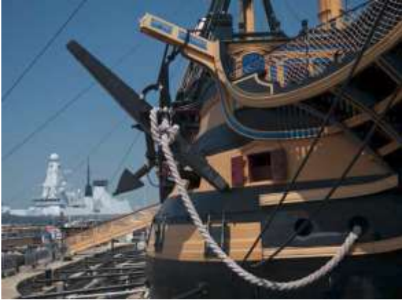
VICTORY in dry dock with HMS DIAMOND in the background.

Major conservation work has been in progress for a couple of years and will be required for many years yet to “stop the rot”. The top two thirds of the masts are away for repair and maintenance; their return is eagerly awaited.