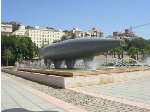
The Isaac Peral in Carthagena.